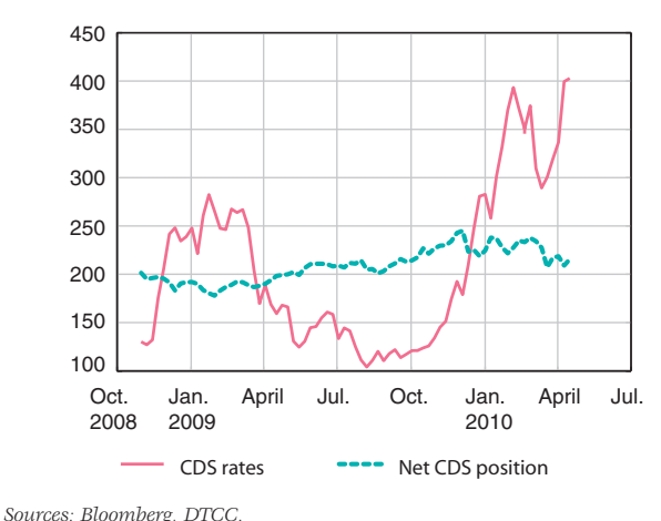
Chart 3 The ratio of aggregate CDS positions (DTCC data) to national debt outstanding

(ratio of net CDS positions to government debt)